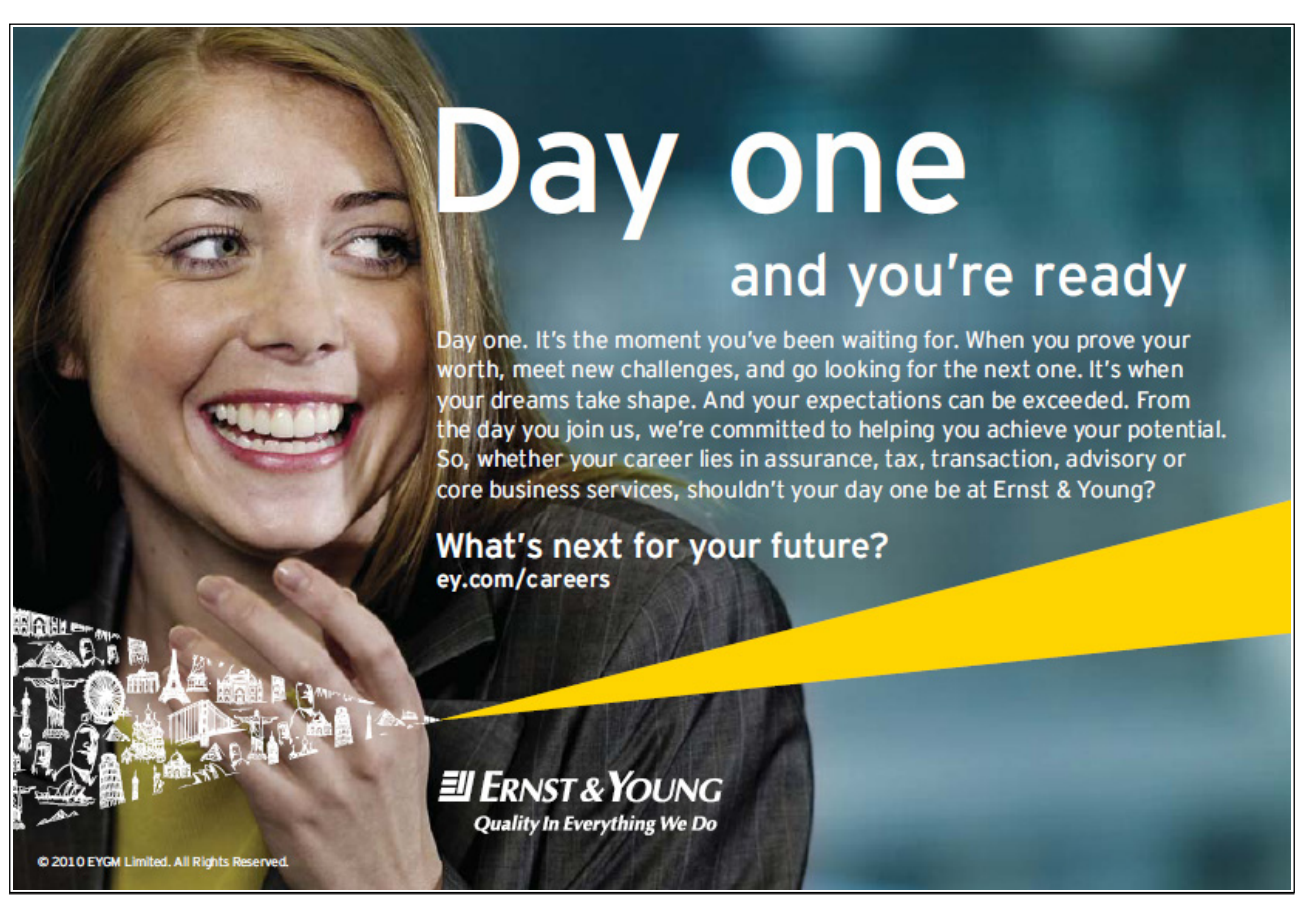
Download free ebooks at bookboon.com