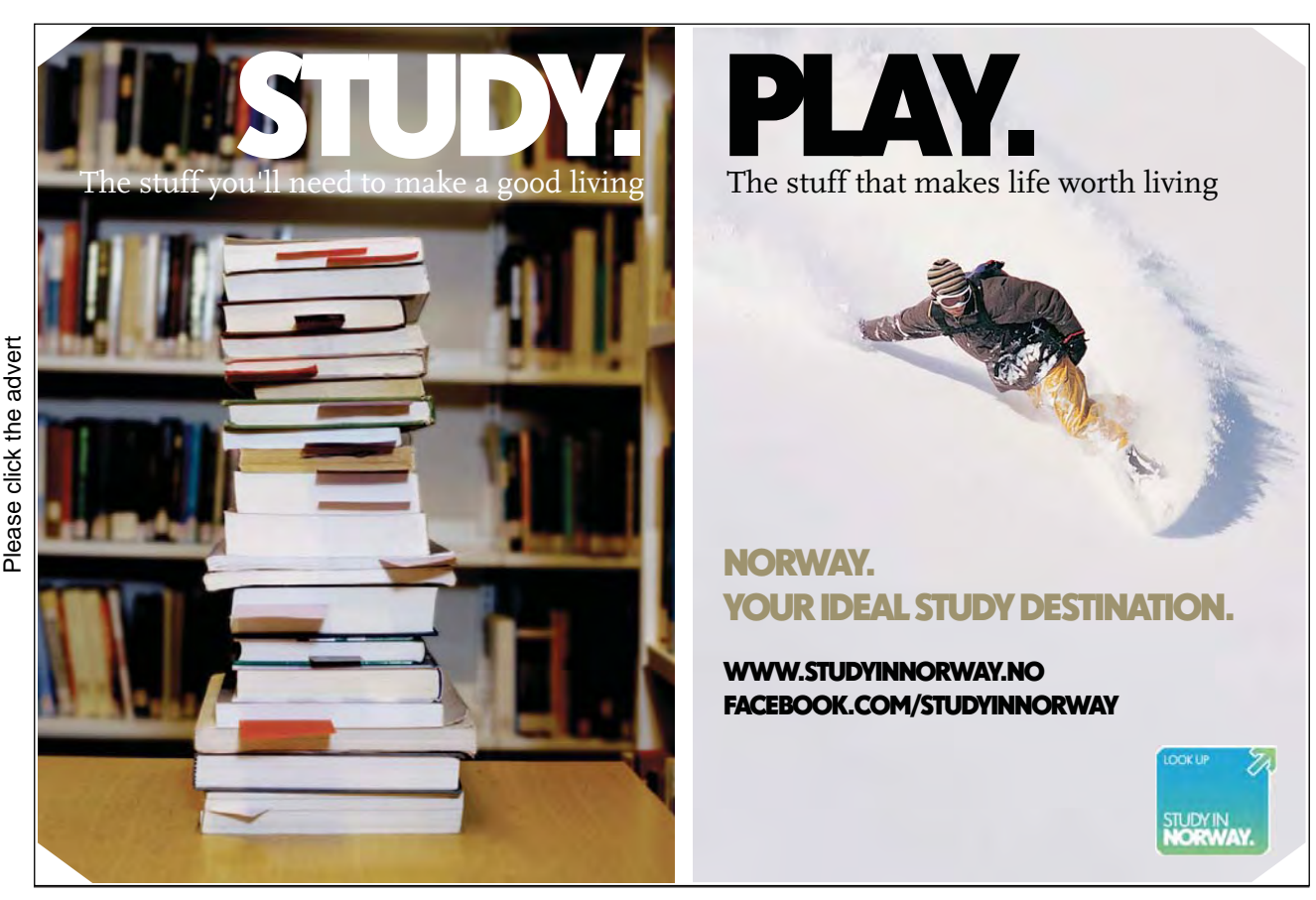
Download free ebooks at bookboon.com

Kerr describes common mistakes that managers make using the principles of operant conditioning, which involves shaping behaviors through the use of rewards and punishments. Operant conditioning is how animals learn to perform tricks and how people learn many of the things they do every day. Behaviors that are followed with positive or desirable outcomes tend to happen again. Negative outcomes diminish the likelihood of their preceding behaviors occurring again. Operant conditioning posits that behaviors occur or do not occur as the result of the rewards associated with the behaviors.