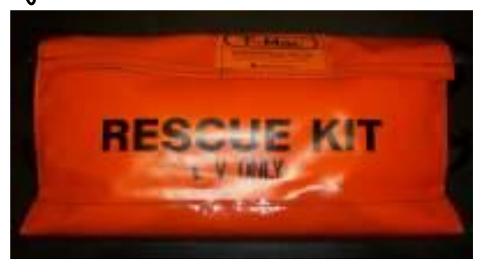
Check LVR kit before starting a job and certify every 6 months

Rescue kits must be checked prior to commencement of work, to ensure the contents are in good condition and applicable to the work situation. The rescue kit should be placed in a suitable position, which is accessible to the work area. Suitable harnesses/lifting equipment may be required to rescue a casualty from a confined space, for example, a cable pit. Rescue from confined spaces is not covered in the training delivered in conjunction with these notes.