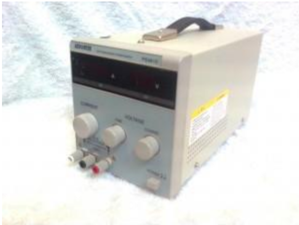
2415-0-T001 : Power Supply - Regulated, 0 > 24Vdc, 15A