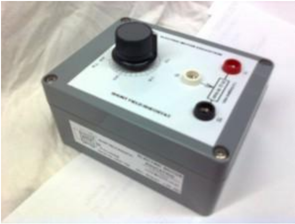
1550-0-300R : Starter - dc Shunt Field Rheostat