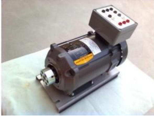
71-0-B100-A : Motor/Generator - 60W, 24Vdc