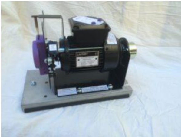
56-0-L010-A : Eddy Current Dynamometer/Load/Brake