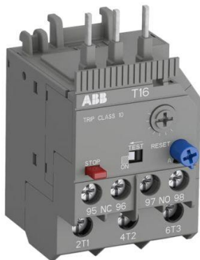
ABB Thermal Overload Relay 1NC/1NO, 13 → 16 A F.L.C, 16 A Contact Rating, 600 V dc, 3P, Thermal