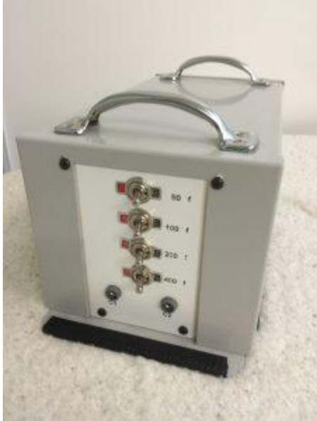
71-1-Cpf001 Capacitor - External Bank-Power Factor Correction