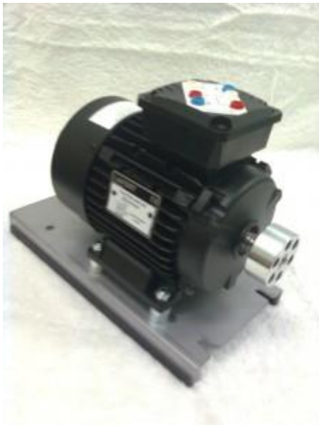
71-3-L004-A : Motor, 3 phase, 44W, 4 pole, 41.5Vac, 50Hz, SCIM