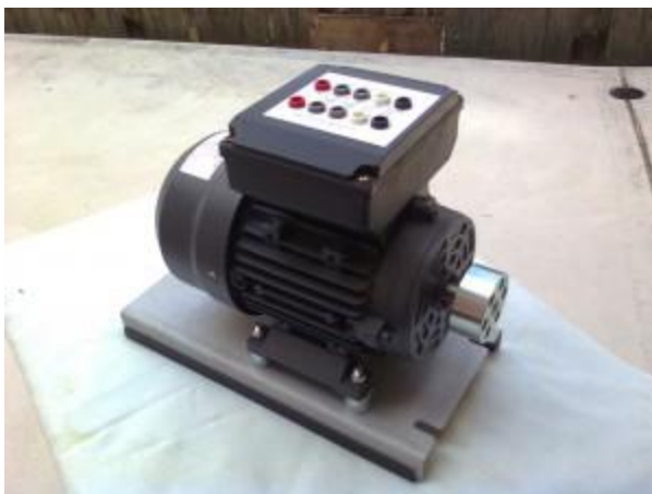
71-1-H100-A : Motor - Single Phase, 44W, 4 pole, 41.5 Vac, 50Hz, SCIM