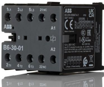
ABB B6-30-01 Contactor, 24 V Coil, 3-Pole, 20 A, 4 kW, 3NO