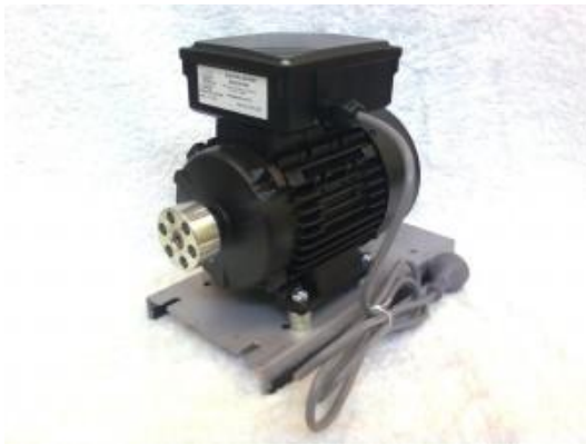
71-1-L900-A : Prime Mover - 240Vac, Single Phase - 4 pole, dual Capacitor SCIM