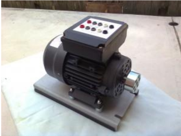
71-1-H100-A : Motor - Single Phase, 44W, 4 pole, 41.5 Vac, 50Hz, SCIM