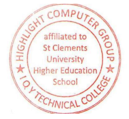
Secretary of Education Board of Government Technical Institute Pyay Registrar of IQY Technical College