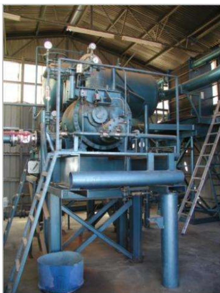
Geothermal equipment at Birdsville.

Currently Australia's only geothermal power station is located in Birdsville western Queensland 1 . The power station allows geothermal power to meet the town's electricity demand at night and during winter. The Queensland government is investing in research to investigate the amount of energy that could be obtained from these 'hot rocks'.